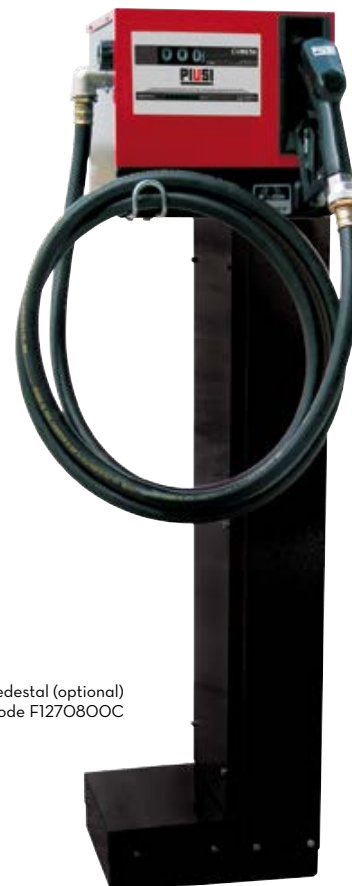
Pedestal (optional) Code F1270800C