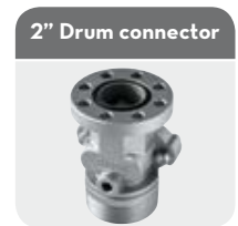
with integrated valve Code F17163000